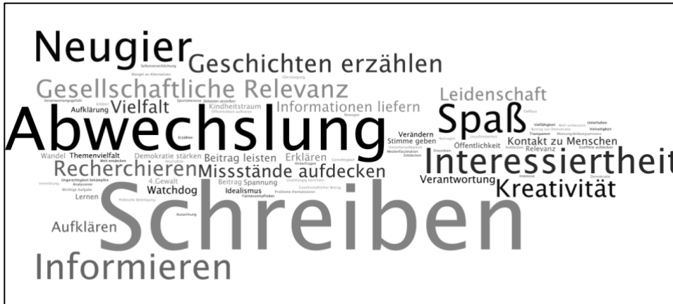
FIGURE 1 Students' primary motives to become journalists

People were asked to name the reasons why they wanted to become journalists and could answer freely. Answers were coded into categories that were used to create the word cloud.