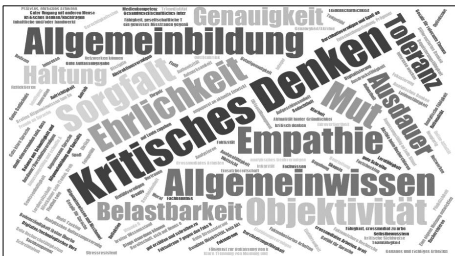
FIGURE 2 What competencies journalists need to have

People were asked which are the three most important competencies journalists need to have these days. Answers were not coded into further categories for this word cloud.